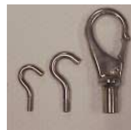
Hook (Only one included with gauge)