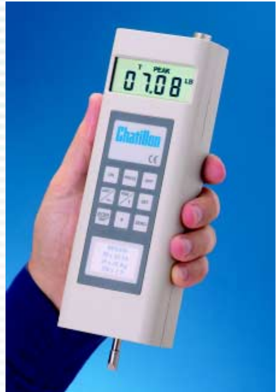
DFGS Series with Integral Loadcell

SPECIFICATION SS-FM-3112-1101 November 2001