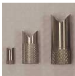
Notch Adapter (Only one included with gauge)