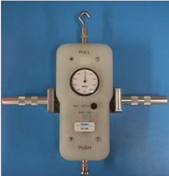
DG Series force gauge shown with optional Handle Set Assembly (p/n SPK-DG-Handle).