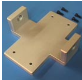
Optional Handle Set Assembly (p/n SPK-DG-Handle).