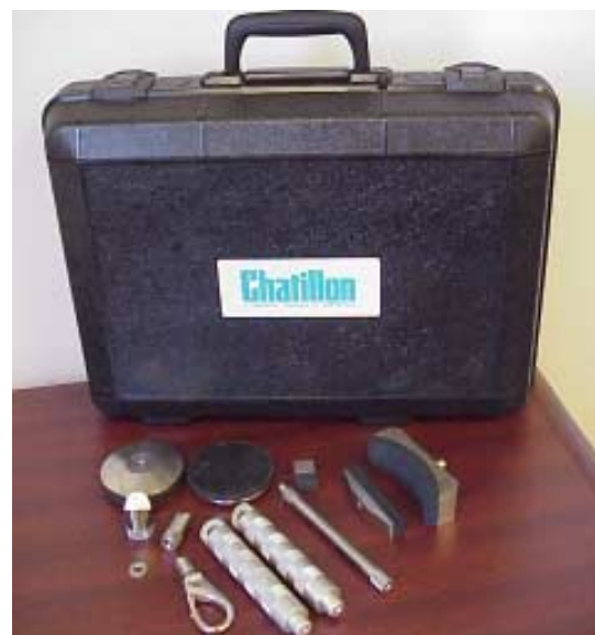
CSDK100 Job Task Analysis Accessory Kit shown with carrying case.