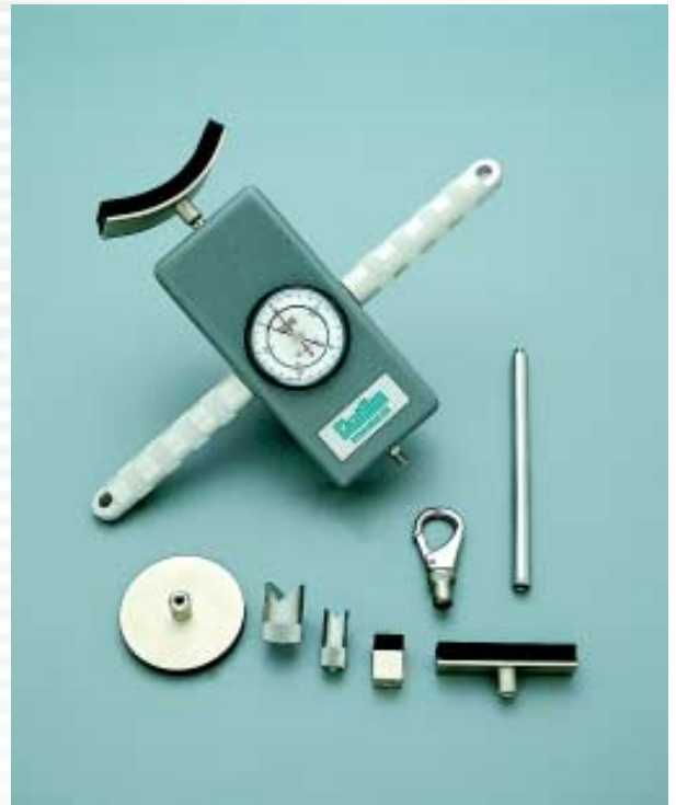
Dynamometer shown with optional accessories.

Objectively quantify an athlete's musculoskeletal force output. Evaluate and document the effectiveness of a prescribed training program. Serially track each patient's progress.