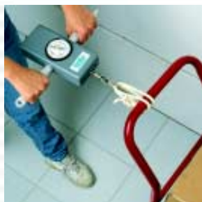
Job Task Analysis

SPECIFICATION SS-MD-3940-0102 January 2002