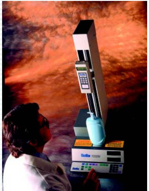
TCD200 shown with DFGS digital force gauge