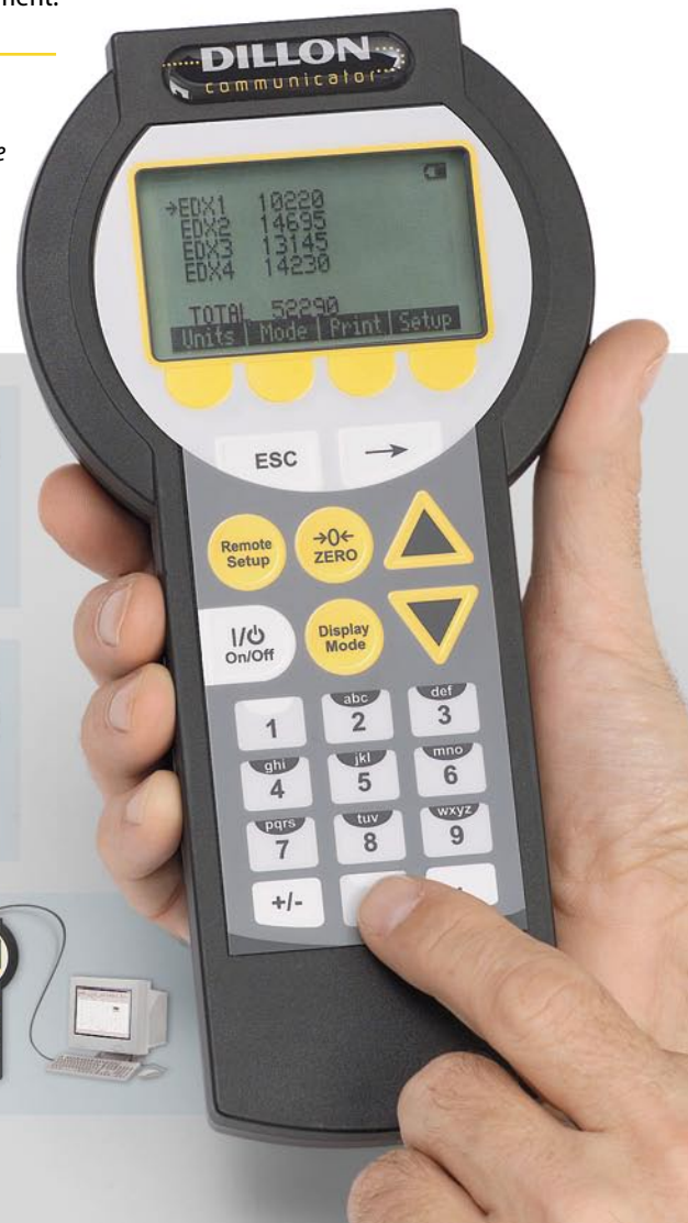
Optional Remote Communicator

A basic stand-alone model can be easily upgraded "in-the-field" to accommodate changing needs. Remote configuration, data acquisition and single point monitoring of multiple links are all possible with the hardwired or radio communication options available with the EDxtreme.